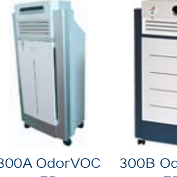
300A OdorVOC EP