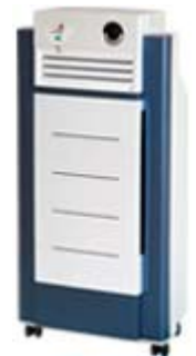
300B OdorVOC HEPA