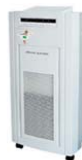
400A OdorVOC HEPA