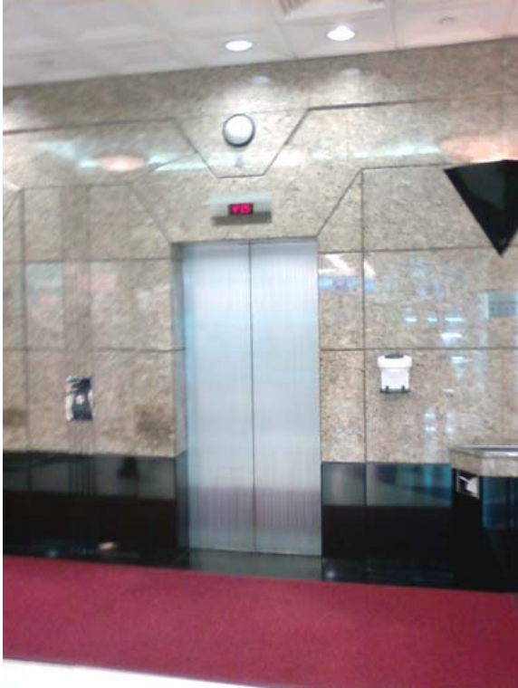
Innoclean – Purezone R601 Inside Lift